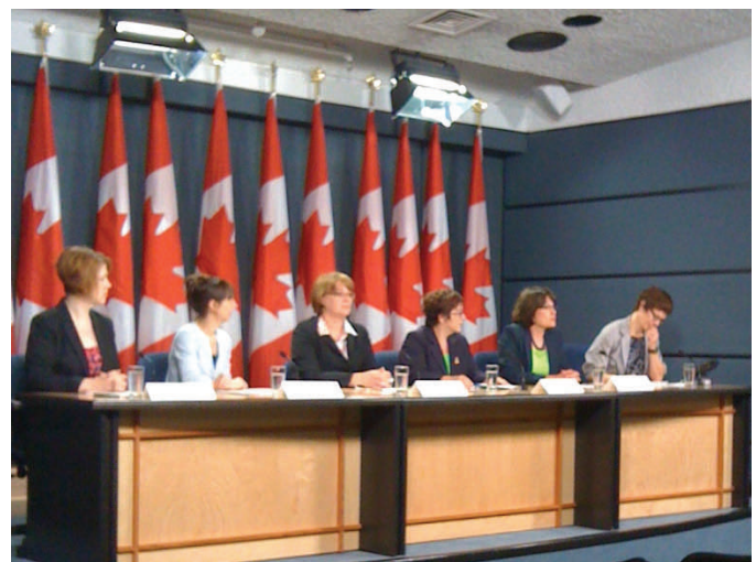
NAF Canada and other women's organizations speak at a press conference on Parliament Hill in Ottawa, ON.