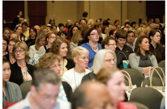
NAF members attend the Opening Plenary at NAF's Annual Meeting in Philadelphia, PA.

Our Annual Meeting once again featured a national workshop for advanced practice clinicians (nurse practitioners, physician assistants, and certified nurse-midwives). The workshop featured Providing Abortion Care: A Professional Toolkit for Nurse-Midwives, Nurse Practitioners, and Physician Assistants developed by NAF, the Abortion Access Project (AAP) and Advancing New Standards in Reproductive Health (ANSIRH) of UCSF. Sessions focused on scope of practice, advocacy, skills building, as well as accredited sessions on medical abortion and ultrasound.