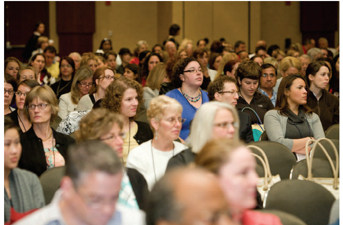
NAF members attend the Opening Plenary at NAF's Annual Meeting in Philadelphia, PA.

Our Annual Meeting once again featured a national workshop for advanced practice clinicians (nurse practitioners, physician assistants, and certified nurse-midwives). The workshop featured Providing Abortion Care: A Professional Toolkit for Nurse-Midwives, Nurse Practitioners, and Physician Assistants developed by NAF, the Abortion Access Project (AAP) and Advancing New Standards in Reproductive Health (ANSIRH) of UCSF. Sessions focused on scope of practice, advocacy, skills building, as well as accredited sessions on medical abortion and ultrasound.