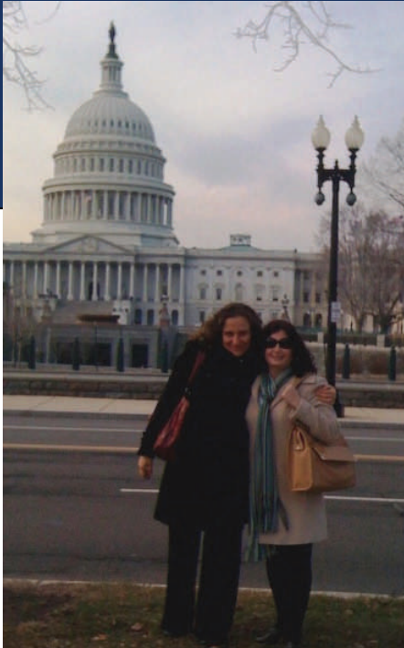
Participants in NAF's Patient Partnership take part in a lobby day.

During the health care reform debate, abortion was used by anti-choice legislators to undermine reform. NAF worked to make sure that the voices of providers and patients were present in the debate. In January, we brought abortion providers and patients to Capitol Hill to describe their experiences with insurance coverage for abortion care.