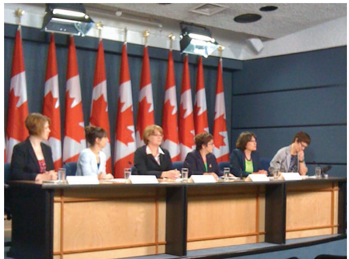
NAF Canada and other women's organizations speak at a press conference on Parliament Hill in Ottawa, ON.